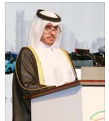
HE the Prime Minister and Interior Minister Sheikh Abdullah bin Nasser bin Khalifa al-Thani addressing the UITP conference yesterday.

Cup eight years from now, the work on extending the rail network would continue and by 2030 Qatar would have 233km of railway lines, covering 96 stations," he said.