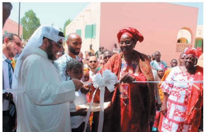
Officials and dignitaries at the opening ceremony.