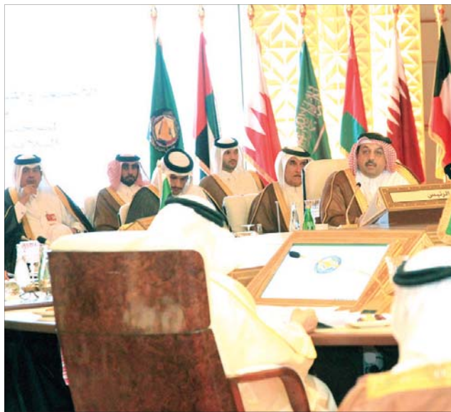
HE the Foreign Minister Dr Khalid bin Mohamed al-Attayah presiding over the GCC Ministerial Council meeting in Doha yesterday. The meeting was to prepare for the 35th GCC summit to be held in Doha on December 9 and 10. Page 8