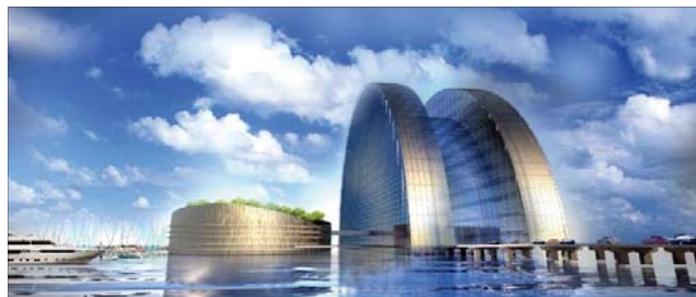
An architect's impression of the proposed Silver Pearl Hotel. PICTURE: M Castedo Architects, New York.

At night, the building's stainless steel glass exterior will be lit with LEDs, its reflection creating an illusion of a shimmering pearl glowing brightly in the Arabian Sea, the statement added.