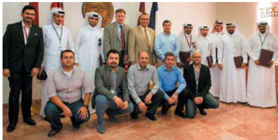
The trainees with QEERI and TAMUQ officials.