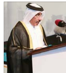
HE the Minister of Transport Jassim Seif Ahmed al-Sulaiti delivering the opening address.

Later HE Sheikh Abdullah opened an exhibition that was being held on the sidelines of the three-day event. A number of regional and local institutions are taking part. Page 12