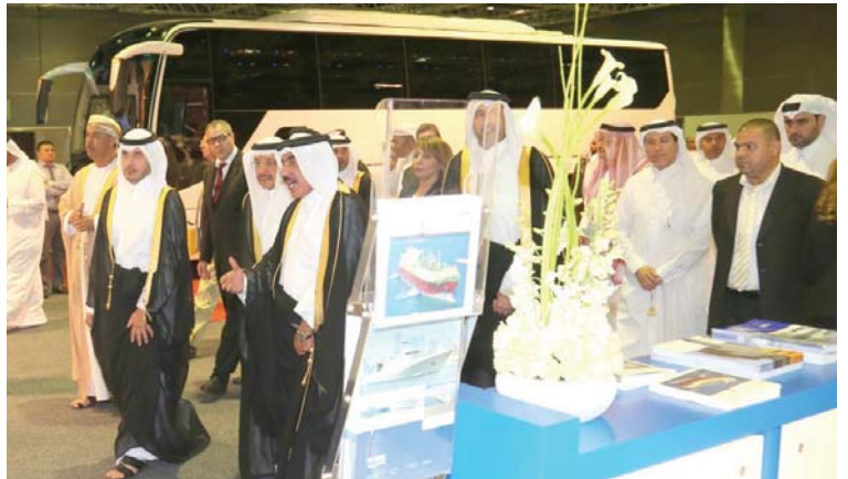
HE the Prime Minister and Interior Minister Sheikh Abdullah bin Nasser bin Khalifa al-Thani and HE the Minister of Transport Jassim Seif Ahmed al-Sulaiti with other dignitaries at the inauguration of an exhibition held as part of the UITP conclave.