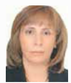
Lina Shbeeb Minister of Transport, Jorda Amman - Jordan