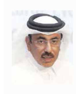
Jassem Bin Saif Ahmed Al Sulaiti Qatar Minister of Transport Ministry of Transport UITP MENA Chairman Doha - Qatar

Under the Honorary Patronage of His Excellency Jassem Bin Saif Ahmed Al Sulaiti, Qatar Minister of Transport, Ministry of Transport, Doha - Qatar